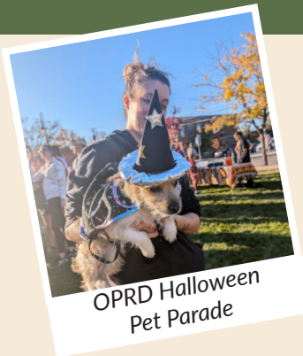
OPRD Halloween Pet Parade