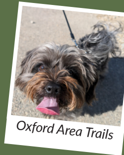
Oxford Area Trails

Conrad Formal Gardens Hueston Woods State Park Miami Natural Area Trails Oxford Area Trails Oxford Community Park